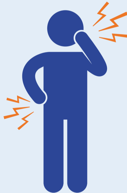
Headache/ muscle aches